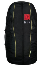
XXL rucksack (200L, 1.6kg)

A full range of GIN accessories designed for use with the Fuse are available: harnesses, rescues, etc.