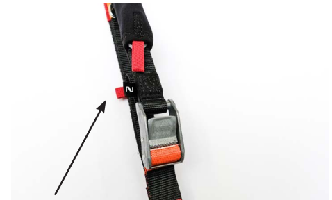
"Trim neutral" indicator