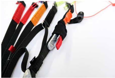
Clamp cleat system